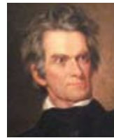
JOHN C. CALHOUN Democrat 1825-32

Son of a Co Donegal Presbyterian father Patrick Calhoun and mother Margaret Caldwell, who was Virginia-born of Co Antrim emigrant parents, this South Carolina statesman was Vice-President to President John Quincy Adams and President Andrew Jackson. Calhoun, a Covenanting Presbyterian, was the leading South Carolina politician of the early 19th century and was Secretary of State for War under President James Monroe