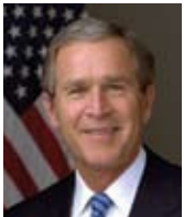
GEORGE W. BUSH Republican 2001-09